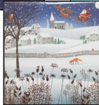
Below: 'Fox in Winter'