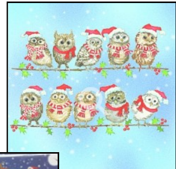
Above L to R: 'Dove' and 'Christmas Hoot'