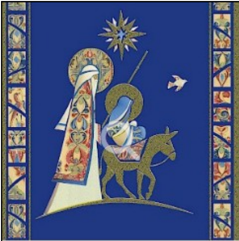
New Christmas Card—Long Journey to Bethlehem